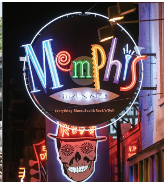
Blues Hall of Fame